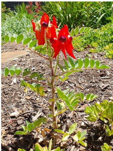
Sturt Desert Pea – Floral Emblem of the State of South Australia – from our very own garden!