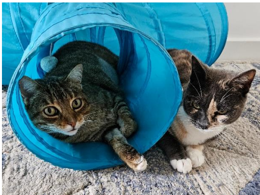
Lily is on the left. This photograph was taken only 16 days before her death, while she was on palliative steroid treatment Juliana is on the right

Our younger cat, Juliana, a calico domestic-short-haired aged 2 years, is now the Queen of Il Palazzo del Gatto .