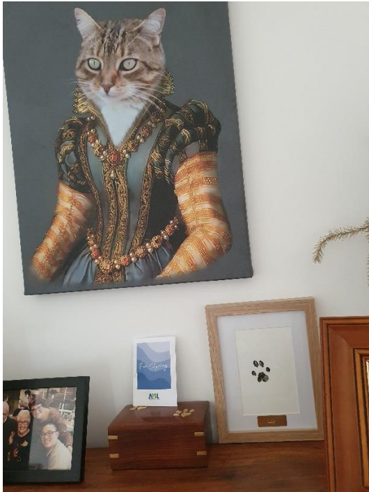
Lily's ashes, paw print, and fur clippings have been added to the Cat Altar

Our younger cat, Juliana, a calico domestic-short-haired aged 2 years, is now the Queen of Il Palazzo del Gatto .